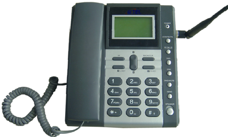
Figure 1 AGP-H series Appearance