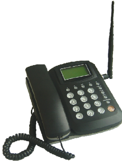
Figure 1 AGP-V900 Appearance

The appearance of the AGP-V900 is as below. The size of this product is 175(L) x165(W) x38(H) mm.