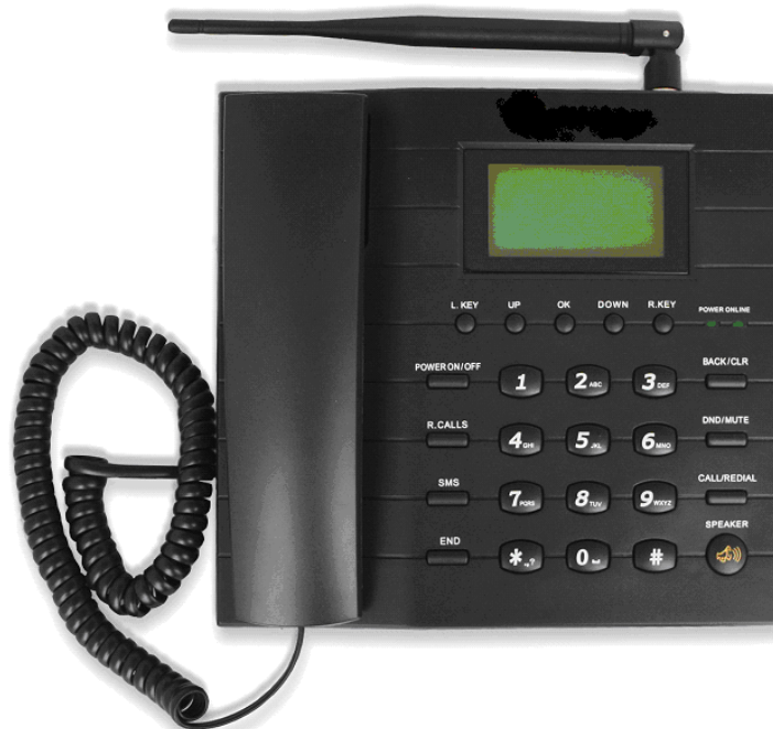
Figure 1 AWP-S series Appearance